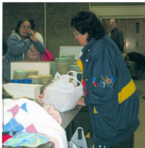
Customers are excited about the amount and quality of goods offered.